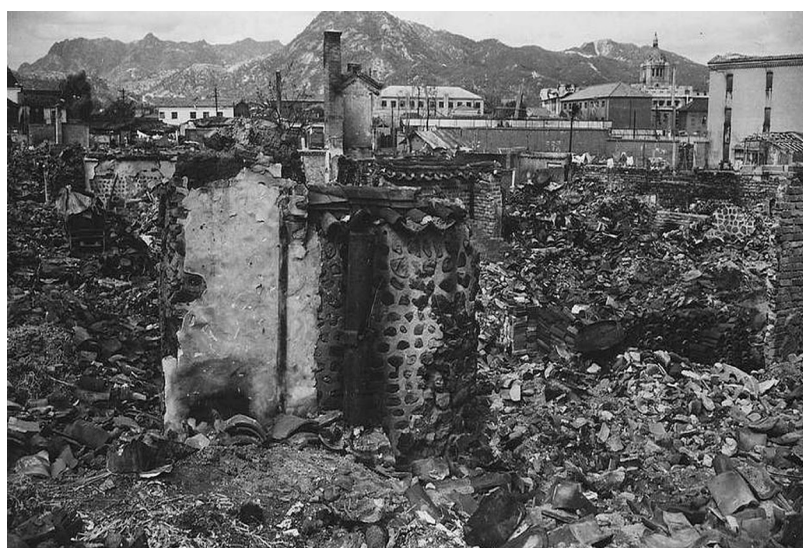
Fig. 1. Scene (1950) of war damage in residential section of Seoul, Korea

For three months following the invasion of the South by the North Korean puppet forces on June 25, the capital city of Seoul was extremely due to their blatant acts of robbery and the desperate destructive acts (Fig. 1) during the September 28 evacuation.