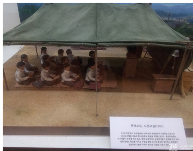
Fig. 3. Exhibits that recreate outdoor lessons during and immediately after the Korean War (Kim O.O., 2021)

Even in the most awful winter, when hundred thousand people the colds and illnesses were lost for famine, government of Southern Korea and have found a way to continue training many children. In a countryside the schoolboys continued study under boards established on wooden poles, and were engaged together, using the bound paper books (O Seongcheol, 2020).