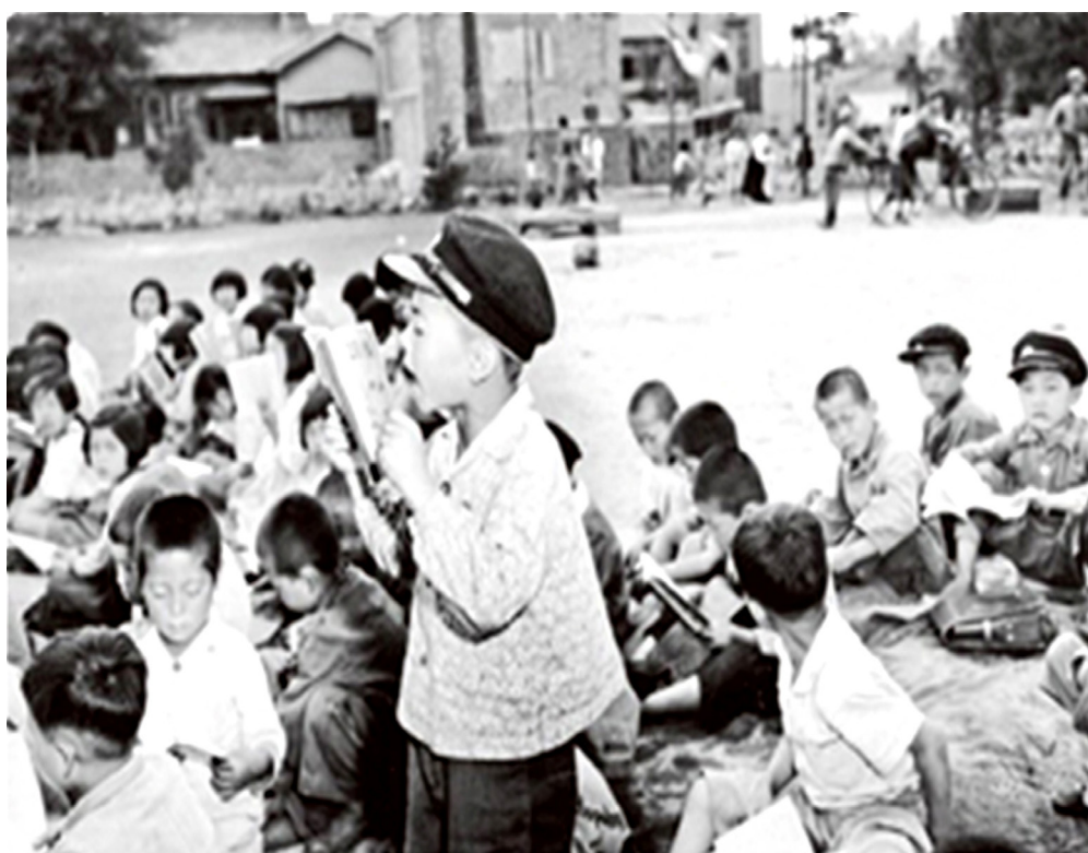
Fig. 2. Children who studied in military schools on the streets of Seoul during the war. Photographed on June 5, 1953 by Warren Lee, a war reporter (Kim O.O., 2021)

Countermeasures Committee was organized. Students evacuated in a straight line to the evacuation site. Measures were taken to have evacuation teachers register with the evacuation province and be assigned as instructors to schools accommodating evacuee students. Due to the destruction of most of schools, the creation of correspondence and radio schools was initiated: as a result of the Korean War, the territory of South Korea was a complete ruin, and radio lessons «in the open air» (Fig. 2, 3) over a large area were the only means of at least partial implementation of the curriculum; with regard to musical and aesthetic education, in the absence of mass use of sound recording reproduction devices, this was the only possibility of demonstrating musical works.